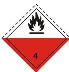
(No. 4.2) Symbol (flame): black; Background: upper half white, lower half red; Figure '4' in bottom corner