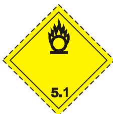
(No. 5.1) Symbol (flame over circle): black; Background: yellow; Figure '5.1' in bottom corner