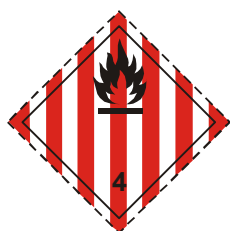
(No. 4.1) Symbol (flame): black; Background: white with seven vertical red stripes; Figure '4' in bottom corner