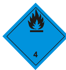
(No. 4.3) Symbol (flame): black or white; Background: blue; Figure '4' in bottom corner