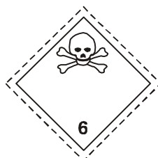
(No. 6.1) Symbol (skull and crossbones): black; Background: white; Figure '6' in bottom corner