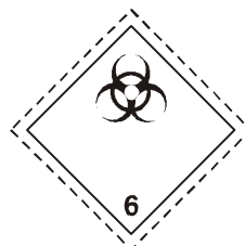
(No. 6.2) The lower half of the label may bear the inscriptions: 'INFECTIOUS SUBSTANCE' and 'In the case of damage or leakage immediately notify Public Health Authority'; Symbol (three crescents superimposed on a circle) and inscriptions: black; Background: white; Figure '6' in bottom corner