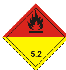
(No. 5.2) Symbol (flame): black or white; Background: upper half red; lower half yellow; Figure '5.2' in bottom corner